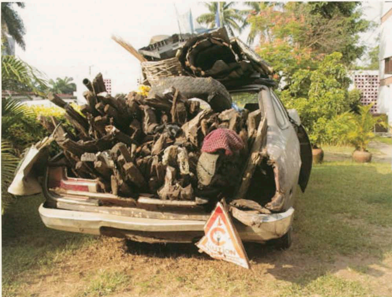
Dilomprizulike, Journey out of Africa 2005. Courtesy the artist

Why Sculpture, Why Here? was formulated as an attempt to understand why one idiom might be more appropriate in a given context than any other, and to what extent international imperatives shape the choices being made by artists in a global age. From the outset, we knew the event could not be exhaustive, but felt it should be as diverse as possible. Hence artists were considered not only for their age, nationality or gender, but because of the expanded notion of sculpture that