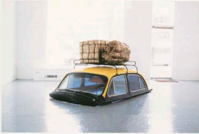
Subodh Gupta, I Go Home Every Single Day 2004.